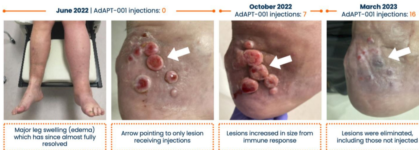
Figure 1 Patient with eccrine adenocarcinoma with near-complete resolution of heel tumors after single agent AdAPT-001 injection every 2 weeks.

responses despite the presence of NABs likely because the kinetics and stoichiometry of antibody neutralization through the hepatic artery are insufficient to clear the high concentration of locally administered OV before they reach target tumor cells. Likewise, NV1020, an attenuated derivative of wild-type Herpes Simplex Virus Type 1 (HSV-1), has been given successfully by hepatic artery infusion for the treatment of liver metastases. 6