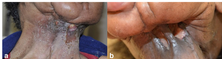
Fig. 2 Appearance of neck mass post pembrolizumab and radiation therapy. a Local control was achieved after 6 cycles of single agent pembrolizumab therapy. b The bleeding mass resolved after radiation therapy

Identifying the most beneficial timing for combined radiotherapy and immunotherapy remains a challenge. If radiation is given prior to, or concurrently with immunotherapy, immunotherapy may be more effective with tumor specific antigens originally generated by radiotherapy. On the other hand, if immunotherapy is