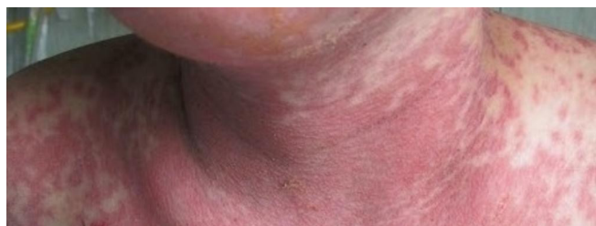
Figure 1 Highly painful confluent erythematous macules.

On the third day (D+3) of anti-BRAF therapy, profound lymphopenia ( 210/\text{mm}^3 ) was detected. The following day (D+4) maculopapular eruption predominating on the photo-exposed areas appeared. Treatment was continued, and a topical corticosteroid was prescribed. The rash worsened over the next days (figure 1), high fever and fatigue also manifested, and 3 days later (D+7) the patient was admitted on an emergency basis with life-threatening conditions.