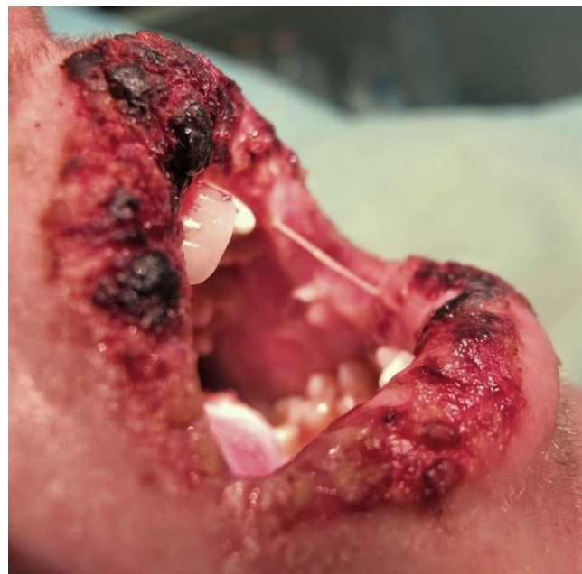
Figure 2 Hemorrhagic crusting on the lips associated with oral mucositis.